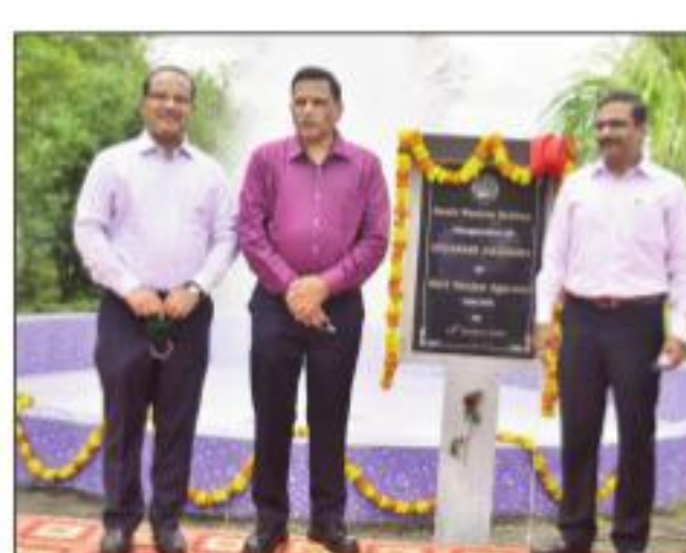
SWR celebrated the 65th Railway week celebrations on October 13, 2020 at Rail Soudha, the Headquarters at Hubballi. The function was unique in the sense that it was organised virtually with the individual

awardees participating through online. The Railway week celebrations are being held award Divisions/Units for their performance during the year and to recognize and award the excellent work done by officers and staff for the excellent work done during the previous year. In the first session a Principal Officers Meeting was convened wherein the Divisional Railway Managers, gave a presentation highlighting their achievements and performance of their divisions which was followed by the Principal Head of the Departments.