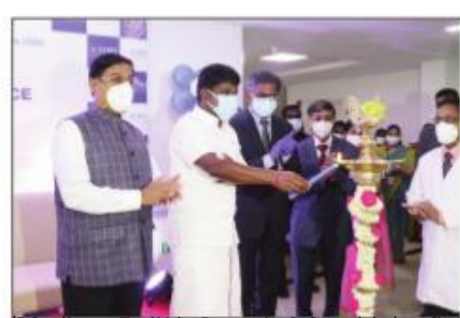
SIMS Hospital (SRM Institutes for Medical Science) one of the leading quaternary care super speciality hospital in Chennai, announced the launch of BONDS,