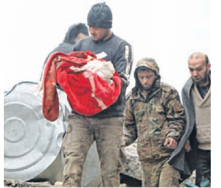
A Syrian man carries the body of an infant who was killed in an earthquake in the town of Jandar in Syria