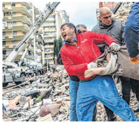
A rescuer reacts as he carries a body found in the rubble in Adana, Turkey, on Monday